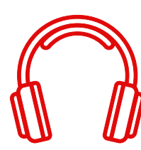
Wireless silent headphones for fully immersive experience